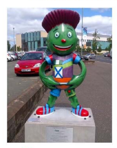
Bouncy Castle, games, face painting, crafts, Beat the Goalie, Coconut Shy, Jelly & Ice-cream, Hot Dogs and Hamburgers. It's going to be MAGIC! Including Owl – Magic.